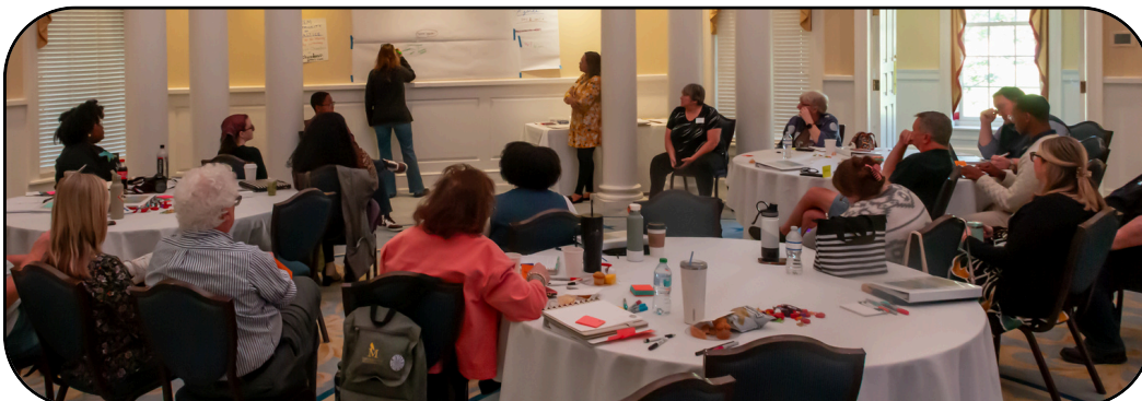
Ripple Effects Mapping Training Event 2025

Article on REM: https://nifi.org/tracing-ripples-strengthening-networks-how-ripple-effects-mapping-builds-community-through-storytelling/